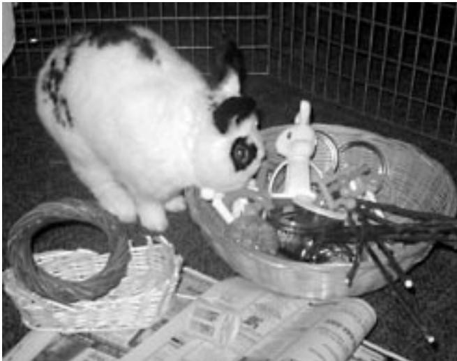
Hydrus the rabbit explores all the wonderful toys he has to choose from: an old phone book (foreground) to tear and chew; untreated willow basket and ring to chew (lower left); a basket full of toys to toss around.

To clean your rabbit cage or pen really well, take it to a do-it-yourself car wash and “power-wash” it with their hoses. You will be amazed how clean your rabbit cages will get!