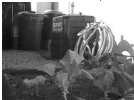
Nothing messy about this compost set-up. The bin sits neatly between trash cans and a raised vegetable garden.

What do you do with your rabbit's dirty litter box? Do you dump it in the trash? Why not try composting? If you have a garden, it's a must. By composting, you can reduce or eliminate the need for chemical fertilizers, you can conserve water, and reduce the amount of material going to our landfills. Compost increases organic matter in the soil, attracts and feeds earthworms (a good thing), aerates clay soils, helps sandy soil hold moisture, helps plants build sound root structures, and reduces water demand.